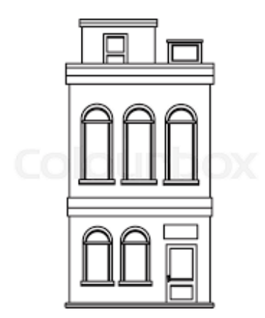
1 tenant evicted for arrears every year

Risk of a new high income tenant defaulting is 20%